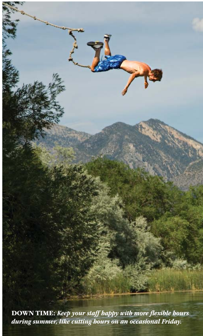
DOWN TIME: Keep your staff happy with more flexible hours during summer, like cutting hours on an occasional Friday.

Even if companies aren't able to implement flexible schedules, allowing employees to occasionally leave early on Fridays can have a positive effect on morale. Many workers schedule weekend trips during the summer and appreciate a head start on their travels. ❖